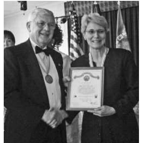
LTC English BOM